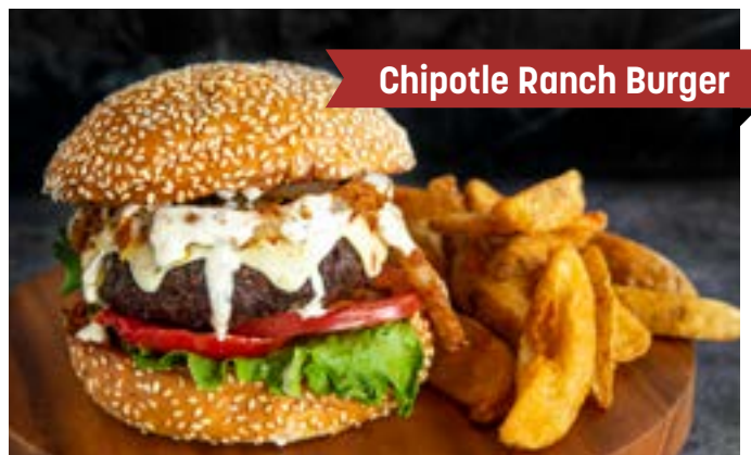
Chipotle Ranch Burger

Three mini challah rolls filled with roasted turkey breast, turkey gravy, mini potato pancakes, havarti cheese, and cranberry sauce. 15.29