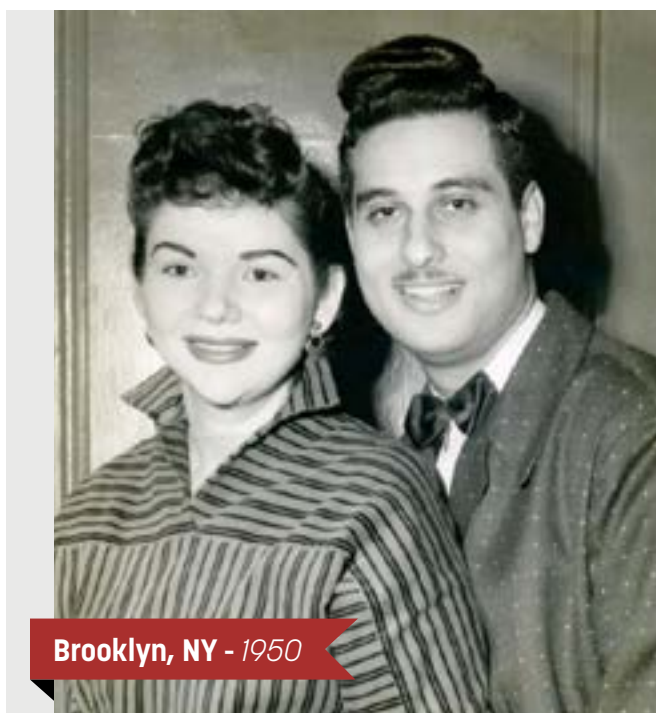
Brooklyn, NY - 1950