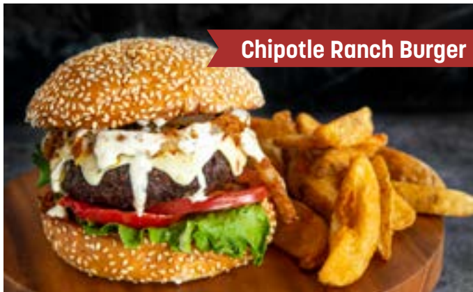
Chipotle Ranch Burger

Turkey Sliders Three mini challah rolls filled with roasted turkey breast, turkey gravy, mini potato pancakes, havarti cheese, and cranberry sauce. 15.29