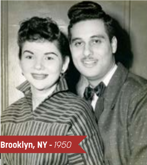
Brooklyn, NY - 1950