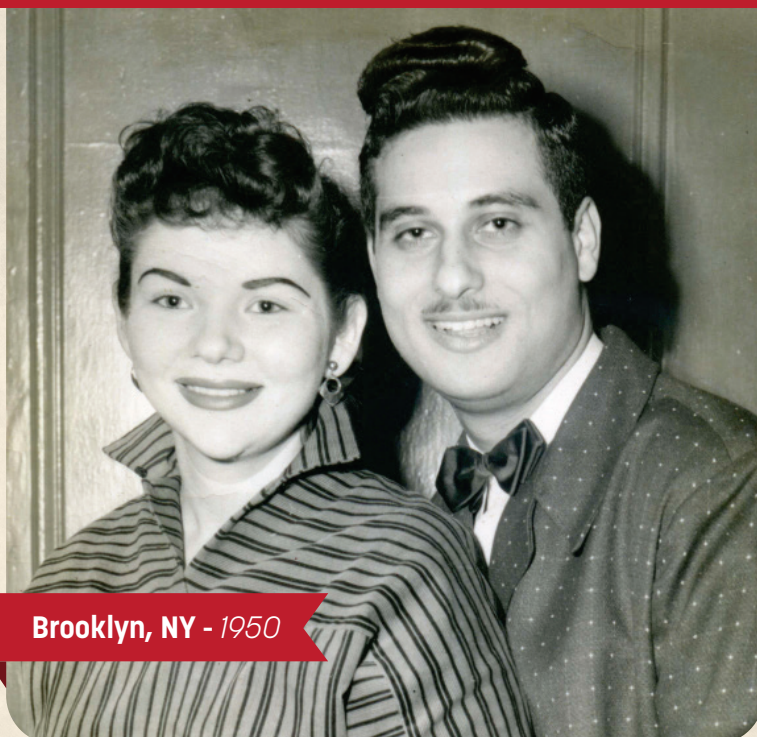
Brooklyn, NY - 1950