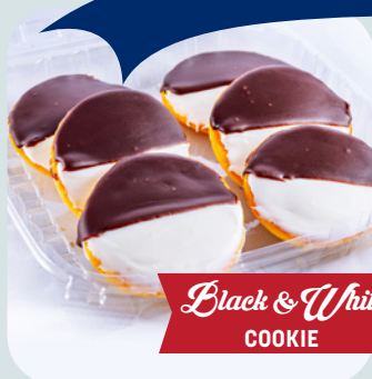
Black & White COOKIE