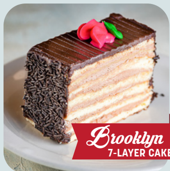
Brooklyn 7-LAYER CAKE